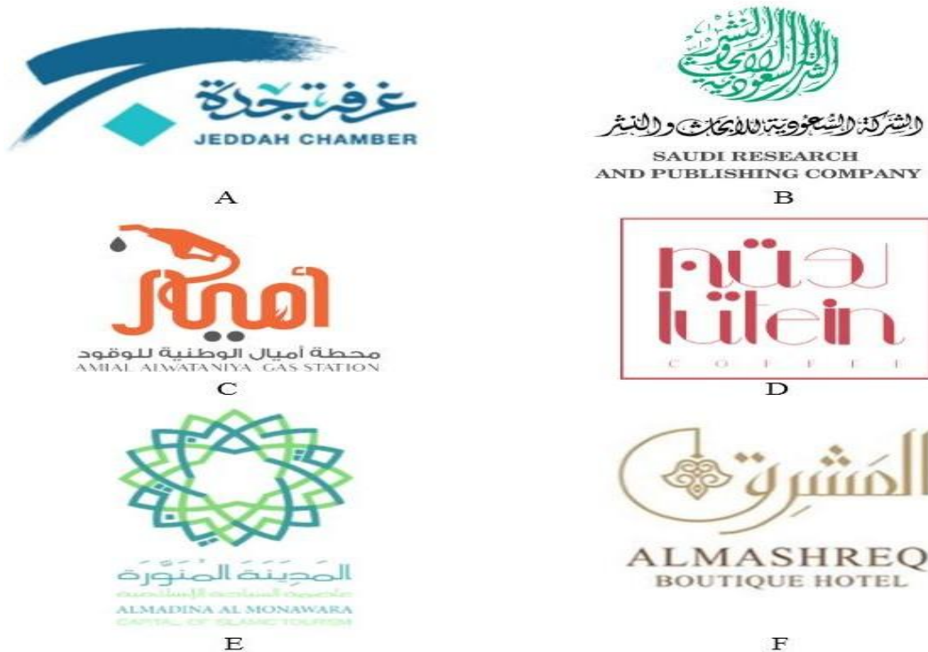
Figure numbers (A, B, C, D, E, F & 14,9) Brands design regarding Characters, events and places