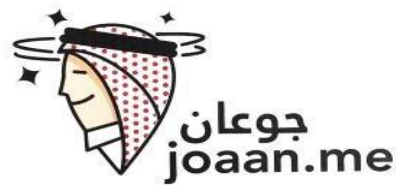
Figure Numbers (10 A,B,C,D) Saudi Brands Figure Numbers(11,A,B,C)