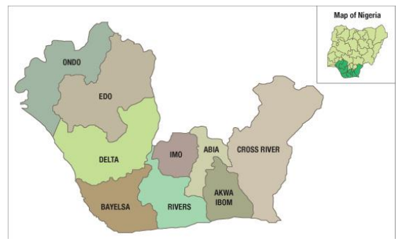
Figure 1: Maps of Nigeria and Niger Delta states

Historically, crude oil in its commercial quantity was first discovered in Nigeria in 1956, before this time, the nation largely depended on agriculture and exportation of its products (Odularu, 2007). He added that due to this discovery, Nigeria turned its focus to this sector so that by the year 2000, about 98% of its earnings are mostly from the exportation of crude oil and gas. The affected area- the Niger Delta is part of Nigeria's coastal area covering about 20,000km2 and housing about 20 million people from different ethnic groups. The Niger Delta states are made up of nine states, Ondo, Edo, Delta, Rivers, Bayelsa, Imo, Abia, Akwa Ibom, and Cross River. This area has many ethnic groups with several languages and a population of about 40million people which is almost a quarter of the total population (Odoemene, 2014). Balonga (2009) and Nyananyo (2007) as cited by Odoemene (2014) stated that the region has one of the highest population densities globally, with 265 people in every square kilometer.