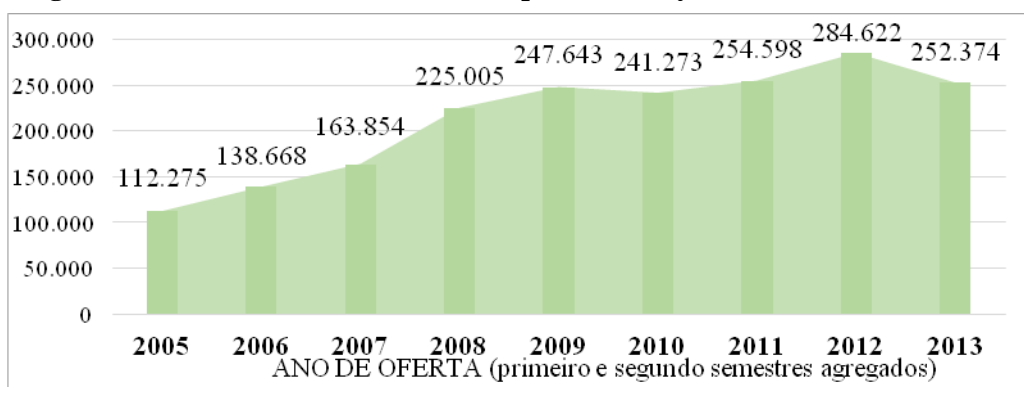
Figure 1: Annual Number of Scholarships Offered by PROUNI - 2005 the 2013

In this sub-section, some data on the evolution of the PROUNI in Brazil are presented. Thus, the data of Brazil are observed, where, from Figure 1, it is possible to verify the evolution of offers of scholarships since the beginning of the program, in 2005.