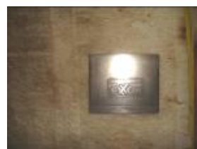
Figure 11: (Experiment 12) Coated aluminum plate with the photo-resist chemical before exposure under the UV light.