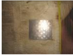
Figure 5: (Experiment 7) Effects on use of the permanent marker as the resist for ferric chloride.

Therefore, it was concluded that although the timing was appropriate, the etching was not significant. As a result the duration of etching process needs to be increased.