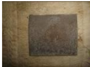
Figure 3: Effect from using the ferric chloride without resist

In this experiment, same material was used using three parts of ferric chloride and one part of water with no resist. Researcher's timing was at 3 minutes and this resulted in proper reaction as this chemical could corrode the aluminum surface and change in texture and colour was noted on the aluminum surface. The conclusion was that ferric chloride is suitable for aluminum in etching technique. In the next experiment, researcher will try different resist and using varying timing before commencing with the 'photo-etching' technique.