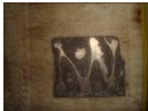
Figure 4: Effects of the rubber cement gum as the resist for ferric chloride.