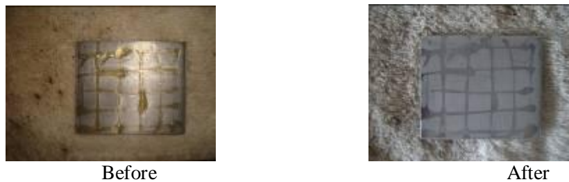
Figure 2: The researcher use pa glue as the resist.

As slight reaction was detected in experiment 4, researcher decided to stretch the timing from 10-minute to 30-minute using the same material and resist. The only changes were the media used whereby researcher experiments using one part water, three parts acid to make a stronger mordant and pa glue as the resist. However, only mild reaction and slight etching effect was noted as in experiment 4. Therefore, researcher concluded that even by increasing the quantity of nitric acid the aluminum surface would not corrode. Hence, researcher decided to try using ferric chloride for the next experiment.