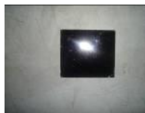
Figure 10: Coated aluminum plate with the photo-resist chemical before exposure under the UV light

This experiment was done by applying photo-resist on aluminum surface to generate etching reaction on the positive side of the film. Researcher conducted a 10-minute trial and it was found that the chemical corroded the metal and there were letter form and geometrical shape was released on the surface as a result of the reaction. Hence, the existence of the release form and geometrical shape through the use of the positive film proved that this technique do take effect and create reaction. However, a black spot that appeared on the metal seed to alter the design of a supposedly logo on the aluminum surface.