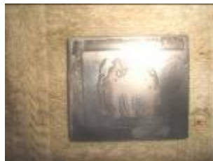
Figure 20: (Experiment 21) The animal symbol designs using the negative line film.

For this experiment, the same material, resist and corrosive media were used as in previous test. The difference was that researcher conducted this test by applying negative film at a trial time of 10 minutes. Animal template was again being used in the experiment and researcher proceeded to conduct this test. It was noted that deep etching happened and design on the surface appeared. The conclusion of this experiment was that this method proved to be an applicable etching technique and satisfactory as the design appeared distinctively.