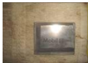
Figure 14: (Experiment 15) The effect of using typographic design and negative line film.

As part of test and error process, the researcher is still experimenting using the same material, resist and corrosive media to create typographic design as in the previous experiment. This time, researcher used the negative side of the film for 10 minutes and it was noted that the chemical corroded as deep etching design appeared on the metal surface. However, as the line film was not properly used and applied on the aluminum metal, therefore it has spoiled the surface after etching process.