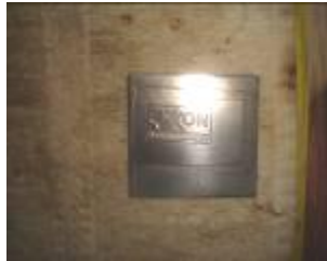
Figure 12: (Experiment 13) the effect of using the negative line film.

As in experiment 12, same material, resist and corrosive media were used and the trial time remained for 10-minute. The only difference was that these solutions were applied on the negative side of the film. The etching reaction happening was noted and this proved that the chemical corroded the metal as logo used depicting alphabets and geometric shape burnt the engraving and appears distinctively on surface. The conclusion was that by using negative film, it could effectively assist in photo etching technique as an engraving style was seen materialising on the metal.