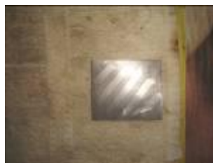
Figure 7: (Experiment 9) Effects from a 5-minute corrosion and uses the gloss black paint as the resist for ferric chloride

In this experiment, researcher conducted test using the same material combined with gloss black to act as resist and ferric chloride as it is a corrosive media. However, researcher decided to increase the time trial to 5 minutes in order to create a deep etching line on the metal surface. Again, it was noted that the chemical corroded the aluminum surface as there were line textures appearing on the metal but this method was not really suitable and timing needs to be increased in order to create good and deep etching technique on the metal.