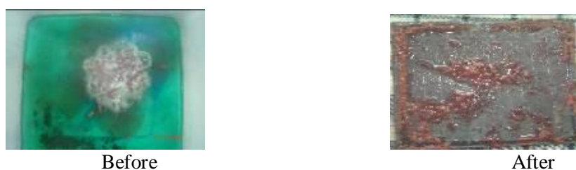
Figure 22: (Experiment 23) Etching with hydrochloric and copper salt

For the next test, researcher used same material and resist. Researcher added copper salt with hydrochloric acid as corrosive media. Researcher already stopped this etching process after 2-minute because the mordant was too strong and corroded the resist and metal surface. Researcher noted the reaction and concluded that chemical corroded the metal badly and spoiled the surface.