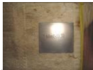
Figure 13: (Experiment 14) The effect of using typographic design and positive line film

In this test, researcher tried again to determine the effectiveness of the combined solution as in experiment 13 to create the best photo etching technique. It was noted that the chemical did corrode the metal after 10 minutes and there were typographic designs released from the aluminum surface. However, since the researcher applied inaccurate procedure whilst sticking off the line film on the metal surface and position of design was wrongly placed, therefore etching reaction was unsatisfactory and results of this experiment was to be considered invalid.