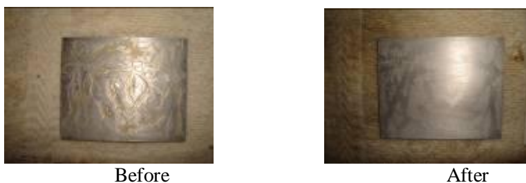
Figure 1: The researcher uses rubber cement gum as the resist and .

In this first test, researcher used rubber cement gum as the resist and starts to create abstract design on the metal surface. Then, the researcher added two parts of water and one part of nitric acid in which the metal plate would be soaked in the tray for one minute. However, no reaction was detected between the mordant and aluminum plate as there were no bubble and the solution did not corrode. Due to this, researcher concluded that one minute was too brief for corrosion to react on aluminum surface.