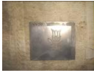
Figure 18: (Experiment 19) The floral designs using the negative line film.

Then, it was noted that etching happened but it was uncontrollable as the chemical corroded and totally spoiled the sides of its metal surface. The problem was maybe due to researcher's fault in not sticking the negative line film properly on to the aluminum surface during UV exposure. Therefore, extra care has to be taken throughout the execution of the experiment in order to ensure good results.