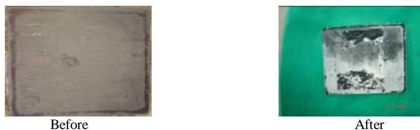
Figure 26: (Experiment 27) Etching with sulfuric acid.

For this experiment, the same material and resist were used and trial time was 10 minutes. Researcher used sulfuric acid with plain water as its corrosive media. The chemical changed to green colors after react with aluminum. Again, it was noted that the chemical corrodes the resist and cleansed up the metal surface. This chemical was suitable as cleaner etch on aluminum surface.