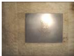
Figure 17: (Experiment 18) The floral designs using the positive line film.

In this experiment, researcher maintained the use of material, resist, corrosive media and positive film for a 10-minute trial. Researcher used floral design as template and as a result, distinctive etching was detected on the metal surface immediately. It was noted that this test produced good release and there was no damages around the surface and researcher concluded that there was adequate photo-resist coated on the metal surface. This test was deemed satisfactory by researcher as the end product test demonstrates suitable photo etching technique.