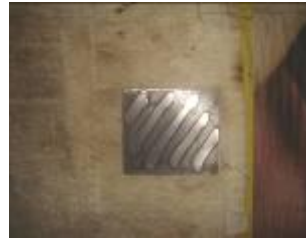
Figure 8: (Experiment 10) Effects from a 10-minute corrosion and uses the gloss black paint as the resist for ferric chloride.