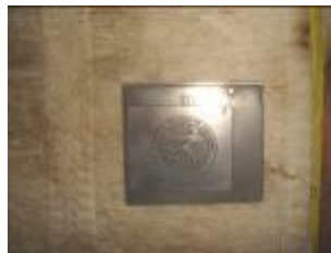
Figure 16: (Experiment 17) The effect of using of logo design and negative line film.

In other words, these black spots have tarnished the layout of the metal surface. Hence, it was concluded that this method is not suitable and researcher will decrease the etching time from 10-minute to 8-minute in order to obtain another result.