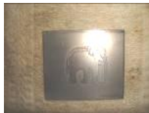
Figure 19: (Experiment 20) The animal symbol designs using the positive line film.

Researcher maintained the use of same chemical combination in this experiment on positive film for a 10-minute trial. An animal design template was used for the etching process and researcher discovered that reaction happened effectively as deep etching appeared on the metal. The end product was distinctively clear and contained detailed etching as this method proved to be suitable in etching technique. Researcher was satisfied with the outcome of this experiment but would still be conducting further tests in effort to come up with the best photo etching technique.