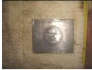
Figure 15: (Experiment 16) The effect of using of logo design and positive line film.

The conclusion derived from this experiment, was that due to lack of quantity in photo-resist on the aluminum metal could not be visibly seen small letter form logo as distinctive as duplicating the exact word size from the template.