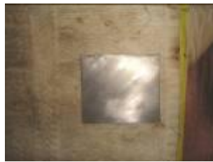
Figure 6: (Experiment 8) Effects from a 3-minute corrosion and uses the gloss black paint as the resist for ferric chloride

Researcher uses the same material combined with gloss black to act as resist and ferric chloride as it is a corrosive media. Researcher wanted to etch a line as the etching design and by conducting the 3-minute test on the surface. It was noted that the chemical corroded the aluminum surface as there were line textures appearing on the metal. The conclusion was that this method is not really suitable and the timing needs to be increase in order to develop good and significant etching technique on metal surfaces.