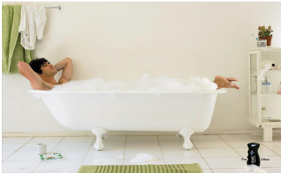
Fig.6 – Axe Advertisement

Despite the fact Axe brand offers several different fragrances, all its brand advertisement bring one cohesive sense of meaning: an explicit idea that Axe smells can irresistibly attract women, setting man free from all approach, convincement or seduction efforts. In these circumstances, Axe man is quite the opposite of classic seductive conqueror, he adopts a position of submission and passivity while woman owns the active and dominator character. This roles inversion gives man a condition of comfort and security because it spares him of shameful possibilities to be disclaimed and rejected. Once woman desires and search him with no shyness man has nothing to worry about neither reason to feel insecure, so his safety needs are attended and satisfied. Sexually confident and shameless women had always been in men imagination: In literature the most knew examples, even though in an implicit way are King Arthur of Camelot and Samson controlled by Delilah in Bible. Masculine fetish of domination by women own the form of the Police woman, the nurse, the school teacher, the beautiful boss and so many other representations in pornography industry; Brazilian Media gives space to personages like Tiazinha,