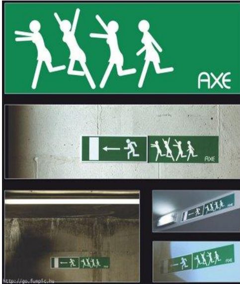
Fig. 4 –Axe advertisement placed on men restroom plaques