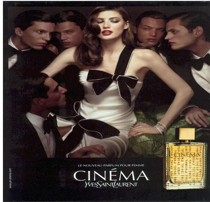
Fig. 2 – Advertisement of Perfume Cinéma – Yves Saint-Laurent