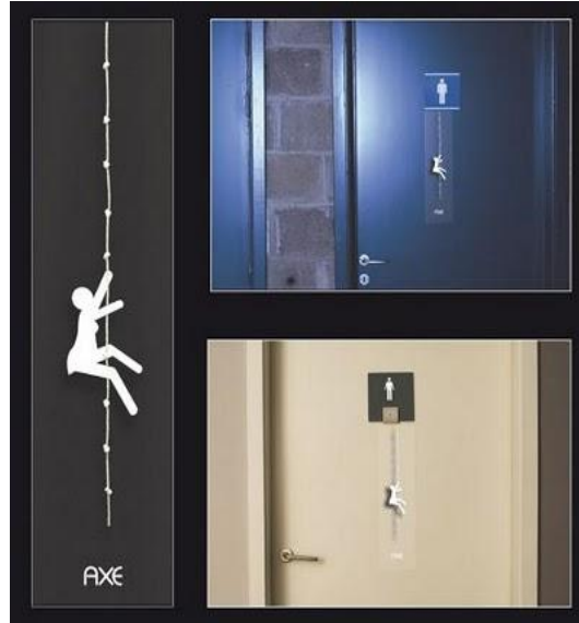
Fig. 5 –Axe advertisement placed on men restroom doors.