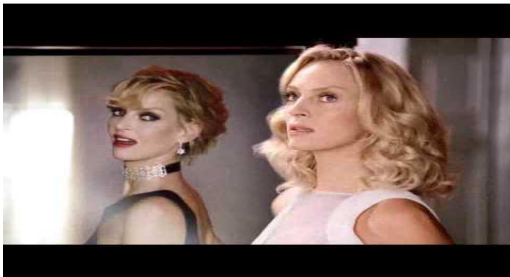
Fig. 8 – The actress Uma Thurman in a scene from commercial movie “Ange ou demon – Le secret”

The duplicity and ambiguity character is not only in the name of the perfume Angel or Demon. It flags all marketing communication about this product for a target capable of hiding or revealing its sexuality as convenient. Ange ou Demon women have an ability to take turns between the Angel and the demon inside themselves, demonstrating a trusty image to the world and another only knew by herself or those she chooses to show.